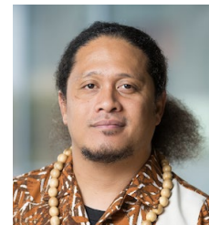
Makerusa Porotesano Portland Community College