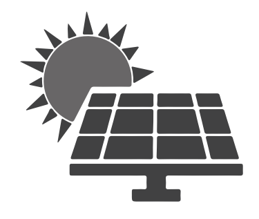
Expandable 250 panel 16kW photovoltaic array installed on the North Wing roof

The event was hosted at the Erb Memorial Union building, which is pursuing LEED Platinum certification and is 35% more efficient than Oregon energy code. Sustainable building features include: