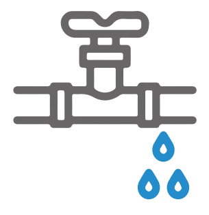
Plumbing fixtures reduce potable water use by 40%